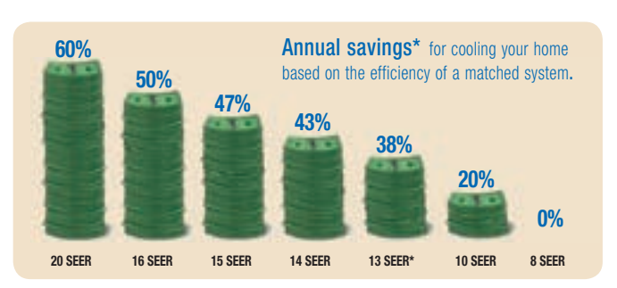
*Minimum efficiency established by the Department of Energy. The majority of systems installed prior to 2006 are 10 SEER or lower. Potential energy savings may vary depending on your lifestyle, system settings, equipment maintenance, local climate, home construction and installation of equipment and duct system.