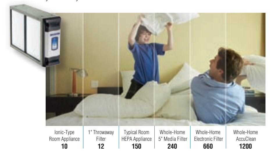
Ratings of cubic feet per minute of clean air delivered for a typical 3-ton heating and cooling system: the higher the value, the more effective the air cleaner.

Want 99.98% clean air? Then choose the home air filtration system that gives 110% – American Standard's revolutionary AccuClean.™ By removing up to 99.98% of unwanted allergens down to .1 micron from the filtered air, AccuClean is 100 times more effective than a standard 1" throwaway filter. Simply put, AccuClean works harder, so you and your family can breath easier.