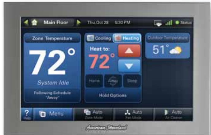
AccuLink™ Platinum ZV (AZONE950)

With the introduction of the AccuLink™ Platinum ZV, American Standard Heating & Air Conditioning will change your perception of controls forever. Precise temperature control is only the beginning. The Platinum ZV also features powerful zoning and scheduling options, plus smart features like live weather radar, weather alerts, customizable backgrounds and a digital photo display option. And it all comes on a bright, seven-inch high definition color touchscreen. Simply put, it's everything your family needs for your busy daily life.