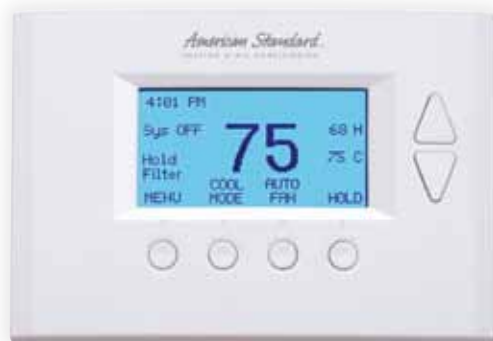
AccuLink™ Remote Control

The AccuLink Remote Control is easily programmable and filled with features. It's loaded with a multitude of built in sensors, reminders and alerts to help homeowners. Program as many as four energy-saving schedules for every day of the week to reduce energy consumption up to 15%*.