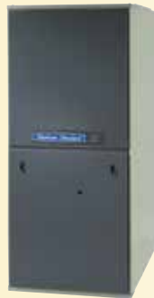
Gold ZM 95 Comfort-R™ Variable-Speed

High quality and high efficiency mean a high standard of comfort for your home. The Gold Series offers just that. Whether you choose variable-speed technology, or a single-stage offering with the power to increase your overall system efficiency, you can be sure that each one contains American Standard's quality craftsmanship.