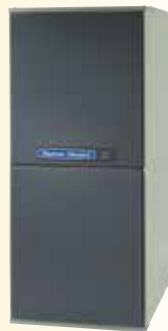
Gold XM 95 High Efficiency Two-Stage