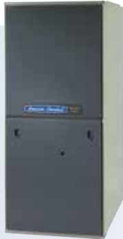
Platinum ZV 95 Comfort-R™ Variable-Speed, Modulating, Communicating

Our most efficient and powerful gas furnace just might be our most comfortable too. With AccuLink™ communicating capability, continuous Comfort-R™ mode and an array of other innovative features, the Platinum Series gives your home maximum efficiency with controlled comfort.