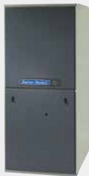
Silver ZI 95 Single-Stage

Designed with value in mind, the Silver Series provides you with the comfort you want, the efficiency and durability you need and, of course, the American Standard commitment to quality you expect.