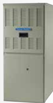
Silver SI 90 Single-Stage