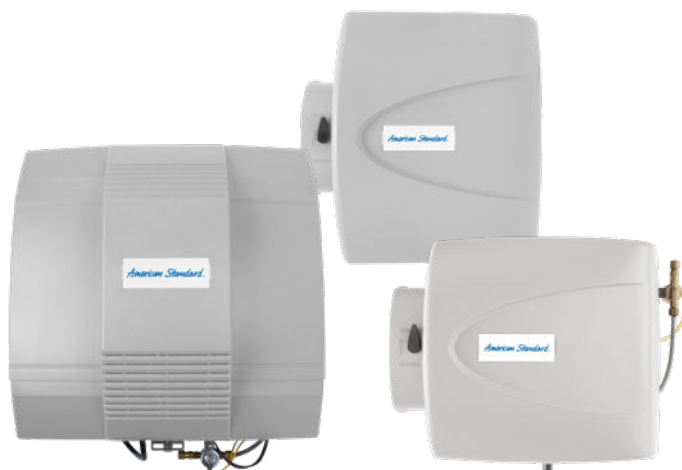
EHUMD500, EHUMD300, EHUMD200